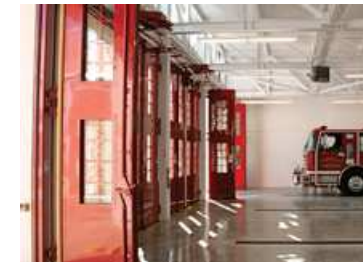
Fire House No. 1

Fire House No. 1 ARCHITECTURE | NEW CONSTRUCTION Unabridged Architecture