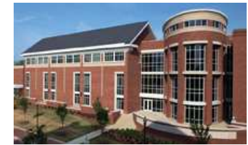
Leo Seal Addition to McCool Business School

Leo Seal Addition to McCool Business School ARCHITECTURE | NEW CONSTRUCTION JH&H Architects Planners Interiors, PA