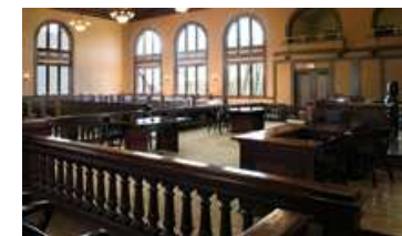
Pontotoc County Courthouse

Pontotoc County Courthouse RENOVATION | RESTORATION Belinda Stewart Architects