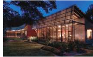
Spring Hill House

Spring Hill House RESIDENTIAL Beard + Riser Architects, PLLC