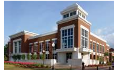
Colvard Student Union

Colvard Student Union RENOVATION | RESTORATION JH&H Architects Planners Interiors, PA