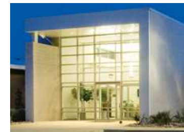
ABC of Miss Headquarters

ABC of Mississippi Headquarters ARCHITECTURE | NEW CONSTRUCTION Cooke Douglass Farr Lemons, PA