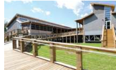
Grand Bay Coastal Resources Center

Grand Bay Coastal Resources Center ARCHITECTURE | NEW CONSTRUCTION Studio South Architects | Lord, Aeck & Sargent